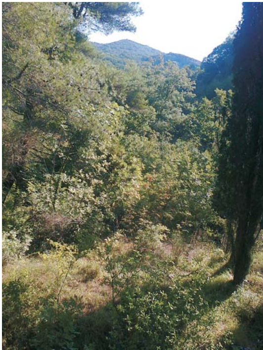
Dio šume iza brda "Lukovik"