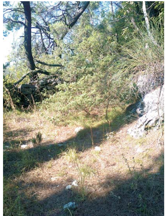
Dio zapadne granice lokacije